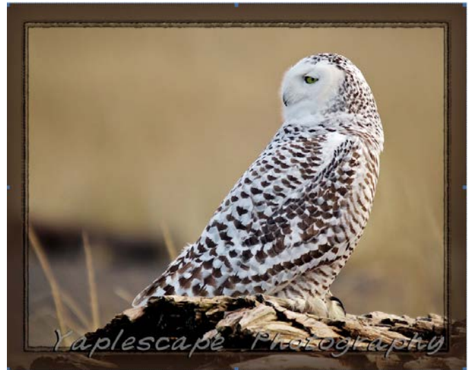
Snowy Owl

Perhaps we'll do it again next December.